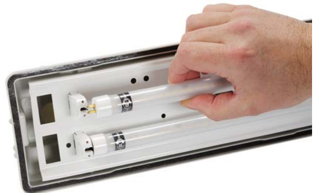
Easy lamp replacement